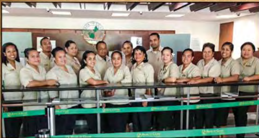
BRANCH OF THE YEAR - POHNPEI, FEDERATED STATES OF MICRONESIA (FSM)