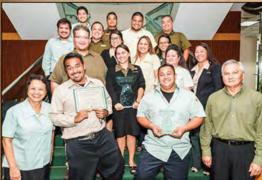
DEPARTMENT OF THE YEAR - LOAN ADJUSTMENT, HEADQUARTERS