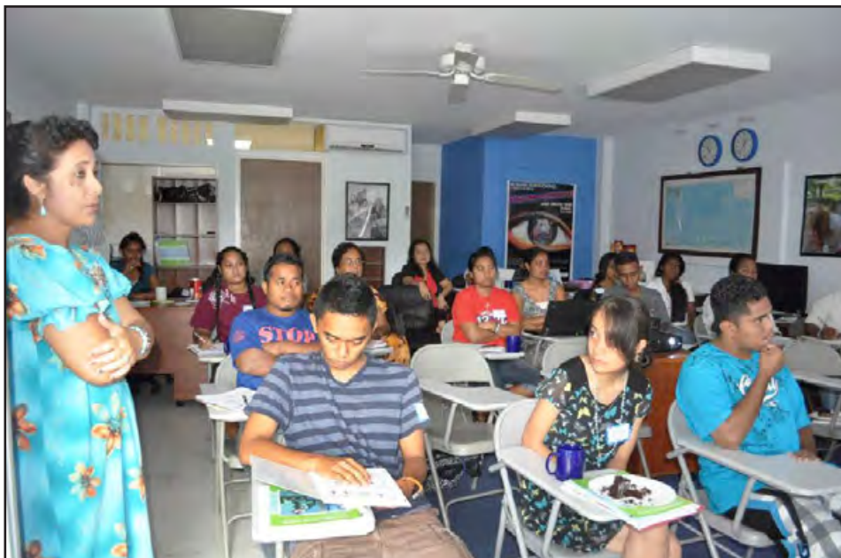
Attendees at the first Pohnpei Migrant Resource Center's pre-departure orientation and Anti-Human Trafficking Awareness Raising course"