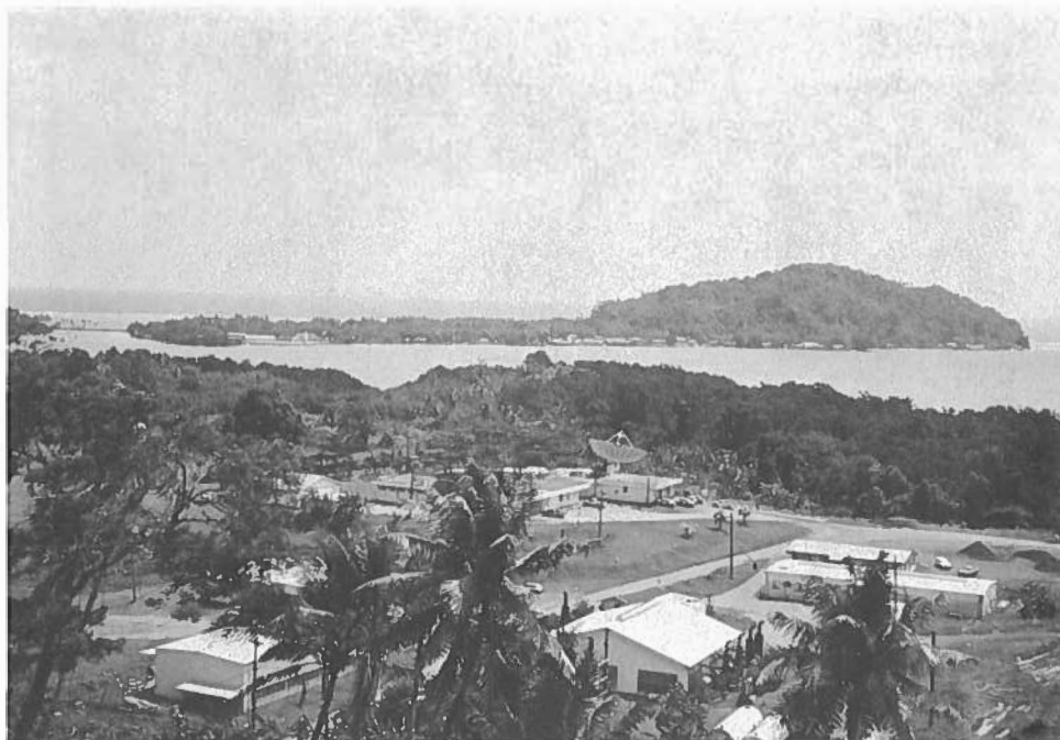
Figure 2. View of Lelu Island to northeast from Kosrae mainland. Artificial islet construction of the Lelu Ruins comprises the entire area to the left of the volcanic hill.

A detailed report on the stratigraphy and dating of the pottery deposits as well as a complete description of the pottery will be presented in another article. Here I would like