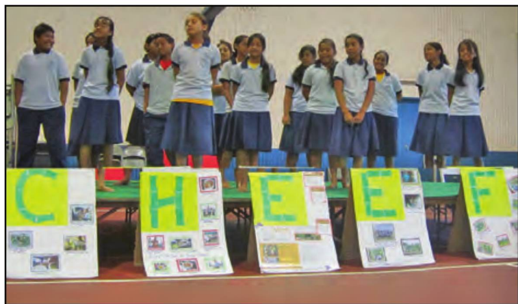
6th graders of Pohnpei Catholic School sang local food related songs at Youth to Youth Environmental Fair

Special thanks are given to IFCP funding sources: SPC CePaCT, Australian Embassy, SPC Healthy Life-Style, UNICEF, Division of Public Health of Pohnpei Department of Health Services, and Japan International Cooperation Agency (JICA).