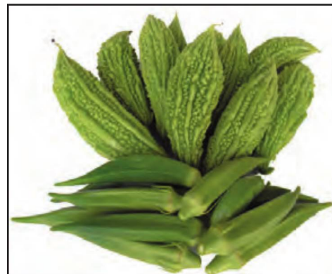
Bitter melon and okra

To succeed in her goal of spreading the value of the "Three Musketeers" and the relative ease of growing them she has provided numerous interpretive tours of her garden. In the last two years, hundreds of individuals have had the opportunity to tour her garden and learn from her experiences in creating a garden that produces an abundant amount of healthy food and promotes the healthy "Go Local" eating campaign.