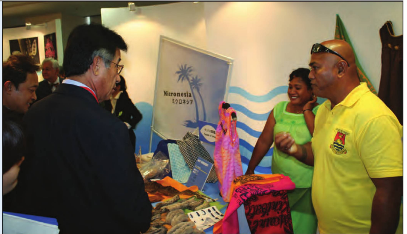
President Manny Mori spends a few moments at the Micronesia booth at a Pacific Islands trade show in Tokyo

Full coverage of the PALM 6 summit will be in the next issue of The Kaselehlie Press.