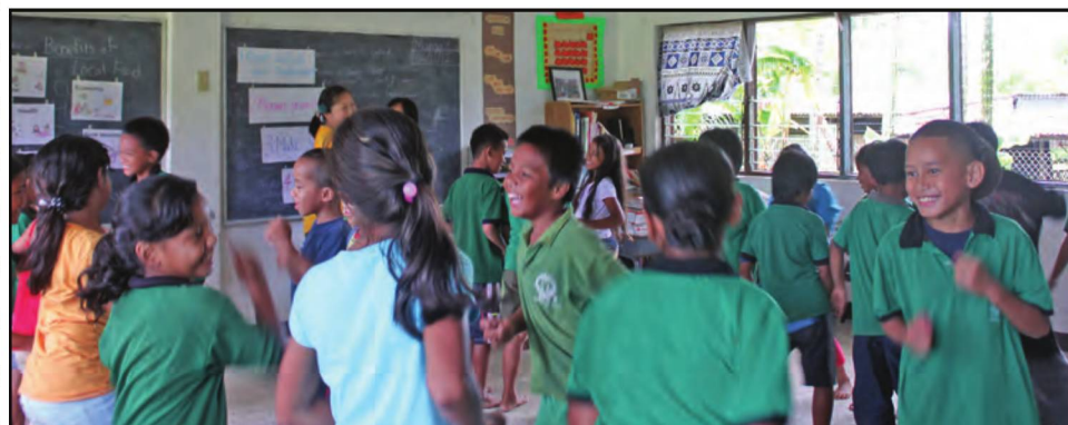
Students baked banana bread with taro flour which they grated and did physical activity-dancing for their health (Ohmine Elementary School)

Special thanks are given to IFCP funding sources: SPC CePaCT, Australian Embassy, SPC Healthy Life-Style, UNICEF, Division of Public Health of Pohnpei Department of Health Services, and Japan International Cooperation Agency (JICA).