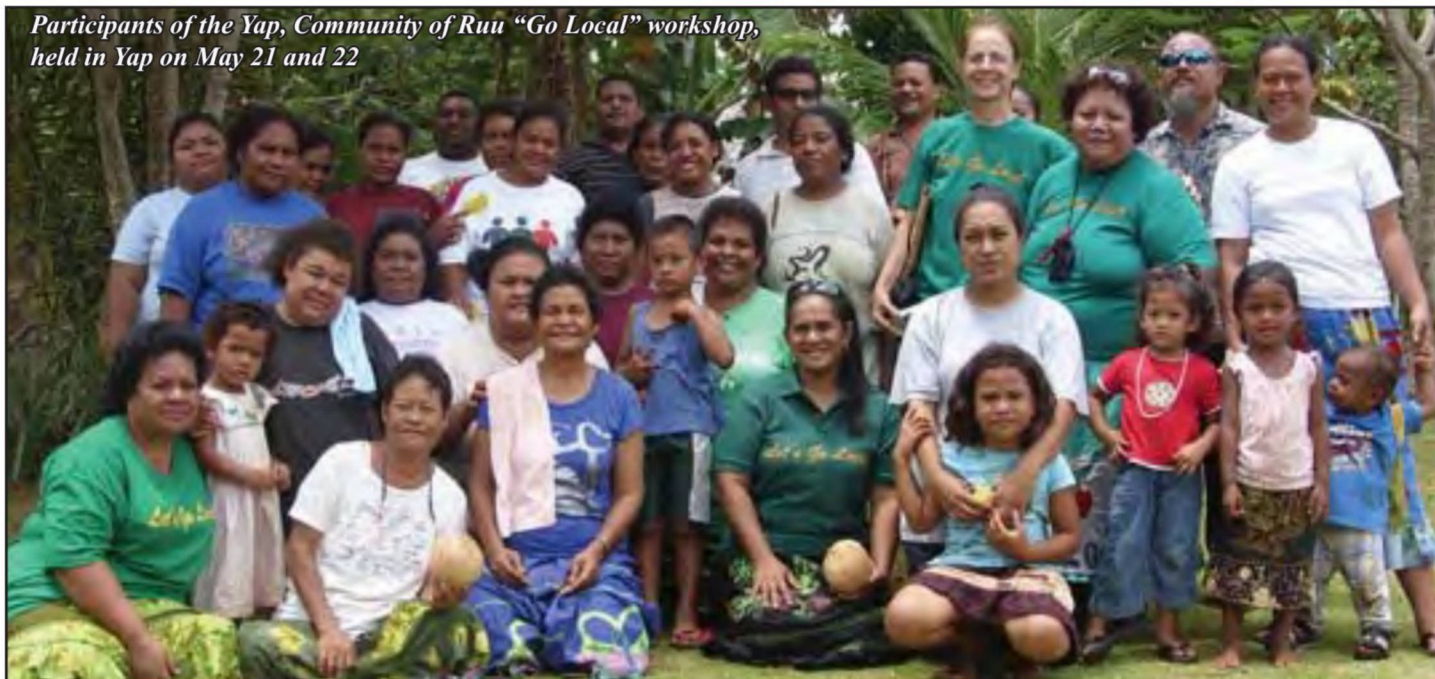
Participants of the Yap, Community of Ruu "Go Local" workshop, held in Yap on May 21 and 22

Warm thanks are given to the US Forestry, Secretariat of the Pacific Community Healthy Pacific Lifestyle Section, Global Greengrant Fund and Global Environmental Facility Small Grant Program for funding support.