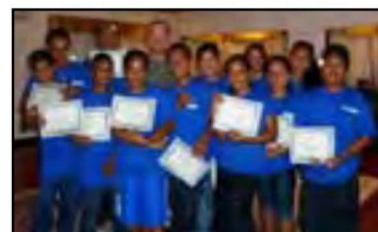
See page 16