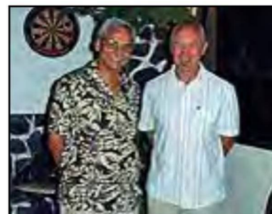
See Page 11