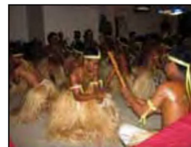
See Page 3