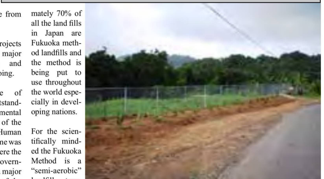
Kosrae Centralized Landfill after conversion to Fukuoka Method