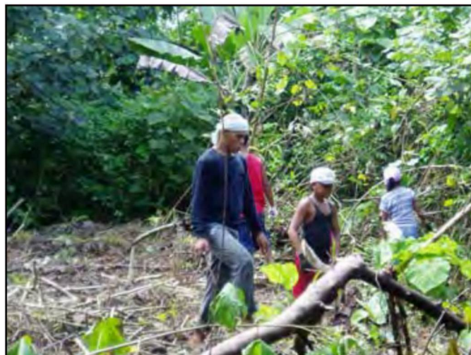
Left: Land cleared by the community members for cultivation. Bottom Right: An elder member of the community teaches the young the art and skills of traditional farming, an important element for the community development. Top Right: Even the female members of the community are involved and empowered to take responsibility of their community.