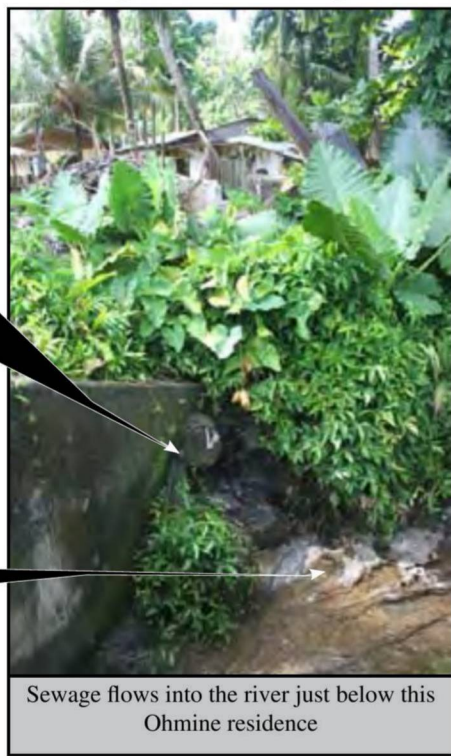
Sewage flows into the river just below this Ohmine residence

The cloying odor of raw sewage is an all