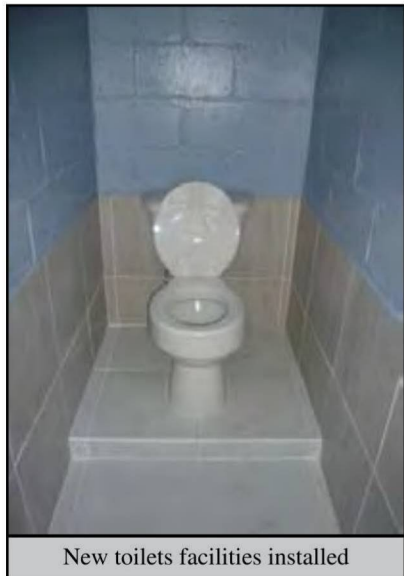
New toilets facilities installed

All of the projects have been major achievements and some are ongoing.