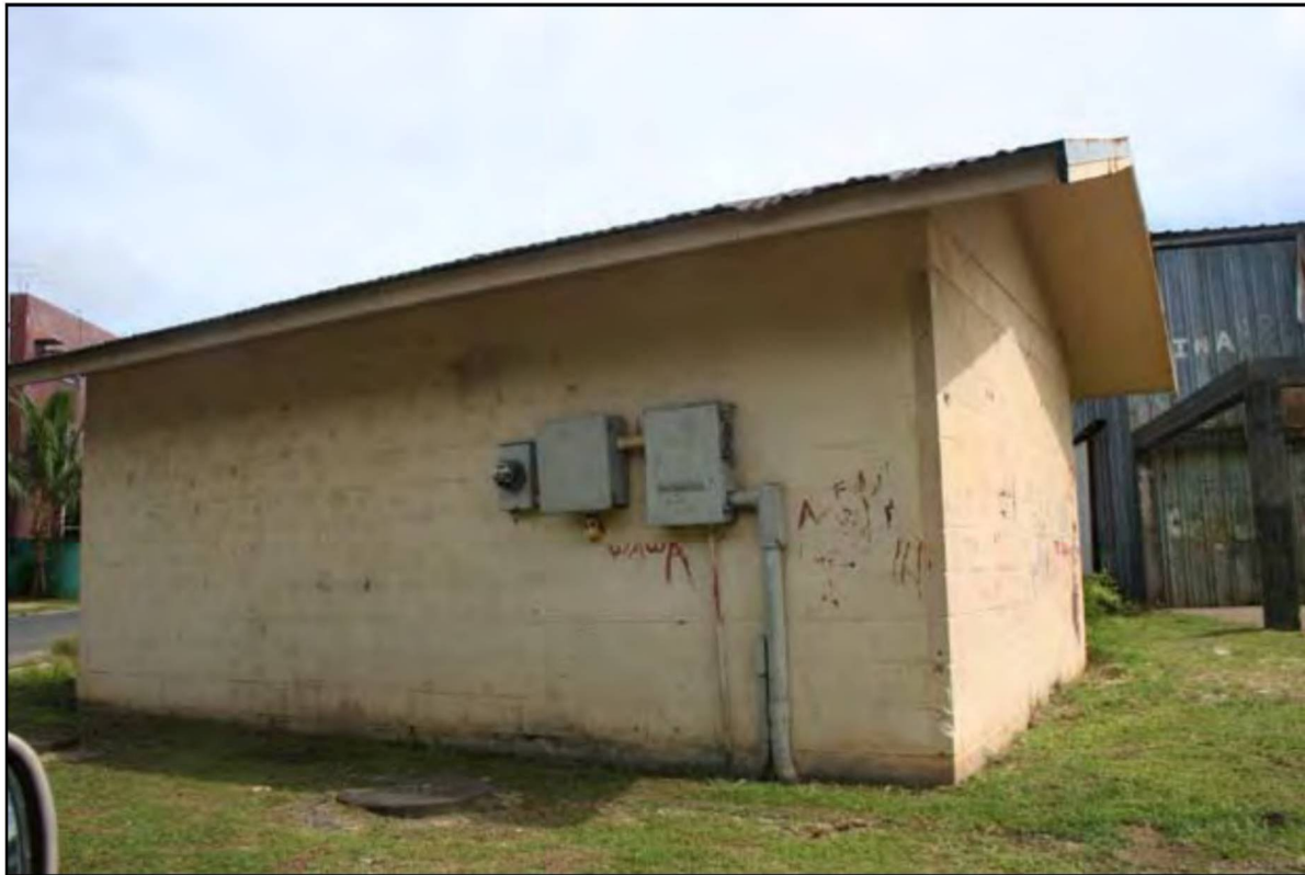
The Lift Station in China Town. Vandals had broken the electrical meter before this June 4 picture was taken.

"A picture is worth a thousand words," she said.