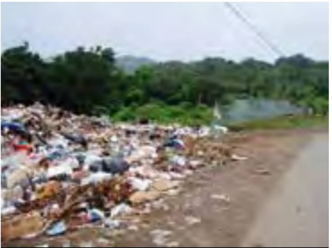
Kosrae Centralized Landfill before

In Chuuk the Government of Japan provided funding for the set up of a student center at Xavier High School which will benefit the students of Xavier as well as those from Sapuk Elementary School.