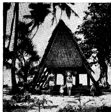
Taking the A-frame.