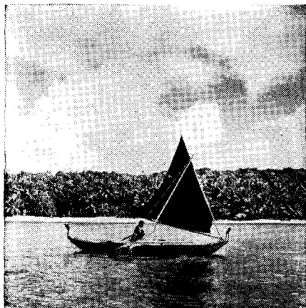
Sailing the lagoon.