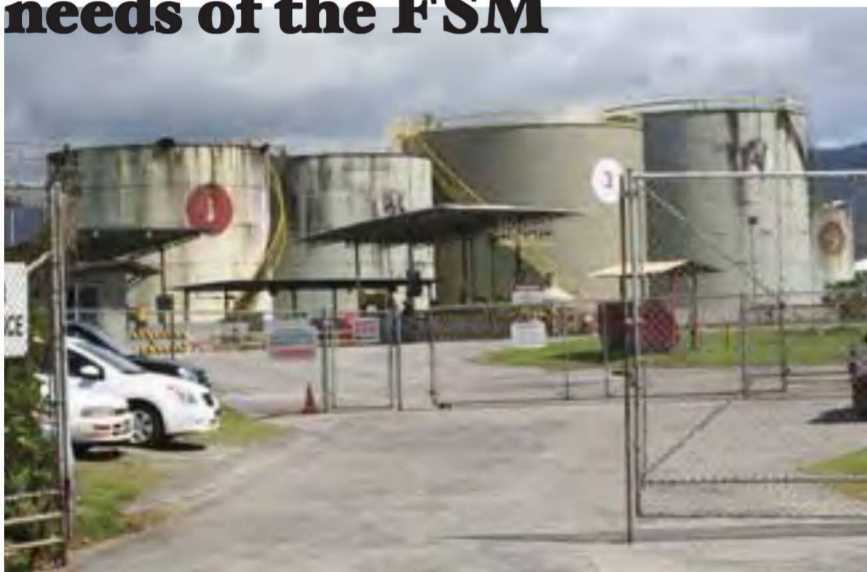
All traces of Mobil's name were removed from the fuel farm in Dekehtik by the 18th of July