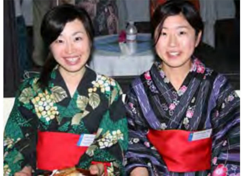
JICA volunteers enjoying the reception at Cliff Rainbow on Saturday, July 20