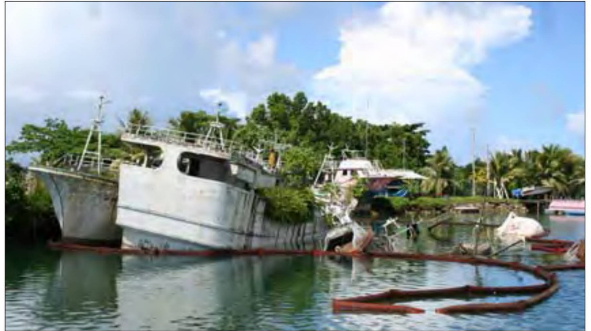
EDA fishing vessels sinking off Deketik in Pohnpei. Fuel barricades seem to have been permanently placed in order to keep fuel from the vessels from further contaminating the harbor. The place reeks of diesel fuel.

EDA is currently operating with an Acting Executive Director which they have