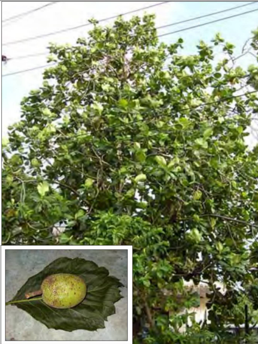
The Mei Tehid variety of breadfruit is distinctive for its non-lobed leaves. Mei Tehid is known as having the best fruit for making the pounded breadfruit dish, Lihli

amount of white rice contains only 6.8 grams of fiber, about one-fourth that of breadfruit, but contains more calories which tend to lead people to overweight problems. Provitamin A carotenoids, which help protect us against infection, diabetes, heart disease, cancer, vision problems, and weak blood, are also found in breadfruit, particularly in the flesh of ripe, seeded varieties. Two cups of ripe seeded breadfruit eaten at lunch and dinner provides 100% of the estimated daily vitamin A requirements for adults. It also contains B vitamins, vitamin C and essential minerals like iron and calcium, making it a richer source of micronutrients than rice, particularly since it is likely to be as part of a traditional diet.