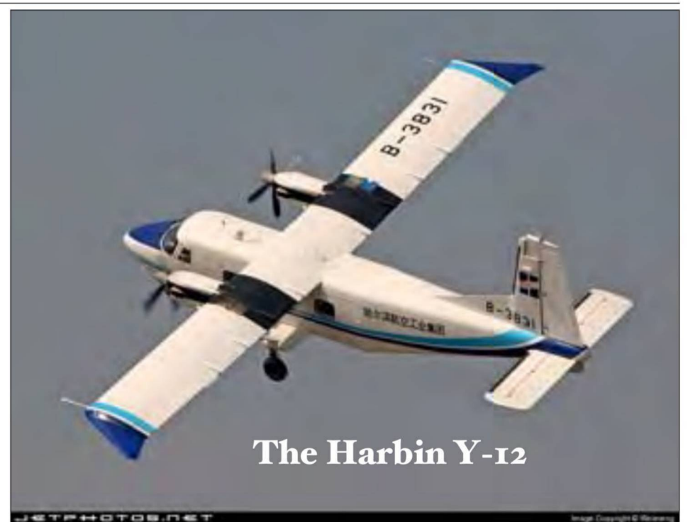
The Harbin Y-12