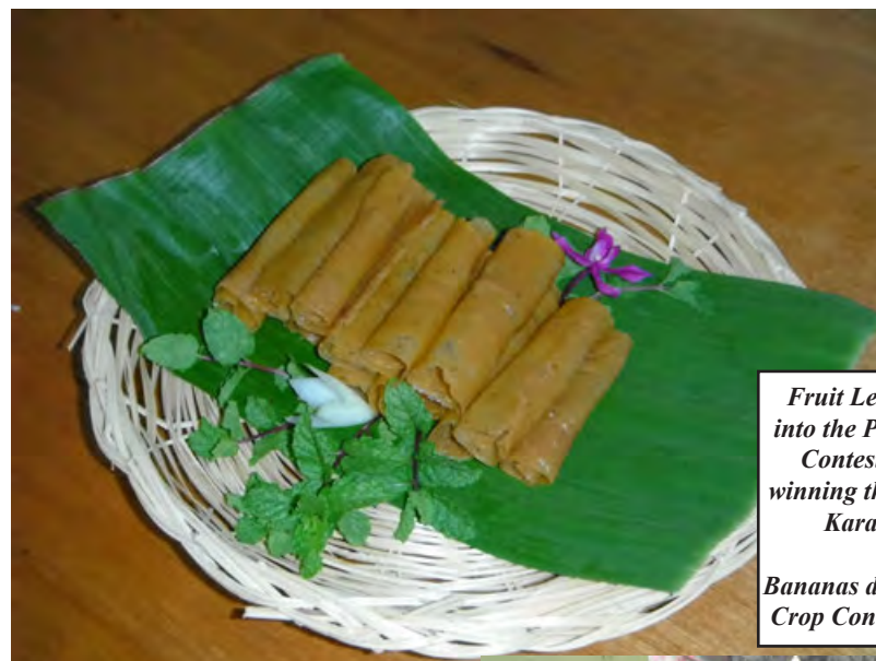
Fruit Leather entered into the Processed Food Contest WFD 2013 winning the 1st Place for Karat category

Be proud of local food and be a part of the event by entering in the competitions or coming along to enjoy the music, activities, food and stalls!