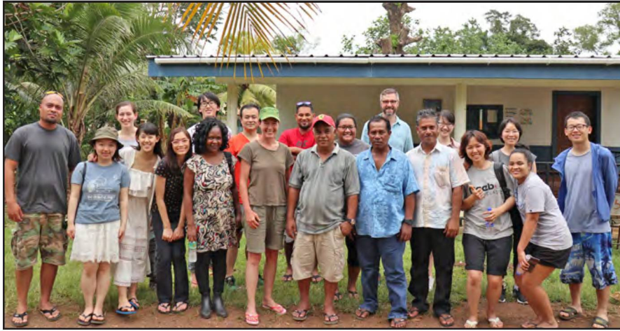
Micronesia Conservation Trust