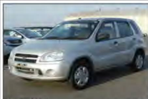
Ref.30279 PRICE: $2,550 SUZUKI SWIFT Year 2005 AT 1,320cc PETROL Mileage 53,000km Color Silver