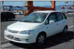
Ref.30179 PRICE: $3,420 TOYOTA COROLLA SPACIO Year 2000 AT 1,580cc PETROL Mileage 44,000km Color Pearl