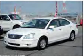
Ref.28835 PRICE: $3,960 TOYOTA PREMIO Year 2007 AT 1,790cc PETROL Mileage 106,000km Color Pearl