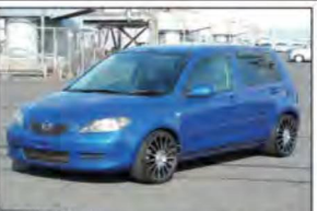
Ref.29600 PRICE: $2,630 MAZDA DEMIO Year 2003 F 1,490cc PETROL Mileage 65,000km Color Blue