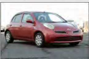
Ref.30397 PRICE: $2,550 NISSAN MARCH Year 2009 AT 1,240cc PETROL Mileage 156,000km Color Red