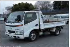
Ref.29209 PRICE: $8,620 HINO DUTRO Year 2001 F 4,610cc DIESEL Mileage 155,000km Color White

*Price Include Car Cost & Freight up to Pohnpei, Yap, Kosrae or Chuuk