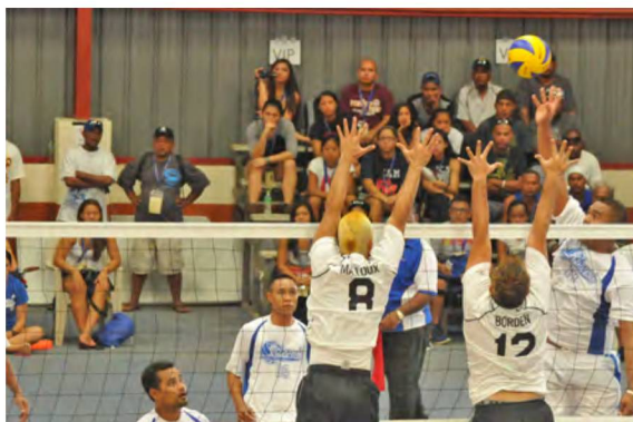
2014 Micro Games Volleyball Championship