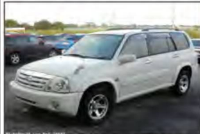
Ref.28892 PRICE: $4,320 SUZUKI GRAND ESCUDO Year 2003 AT 2,730cc PETROL Mileage 119,000km Color Pearl