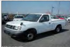
Ref.30158 PRICE: $6,360 NISSAN DATSUN TRUCK Year 1997 C 1,990cc PETROL Mileage 99,000km Color White