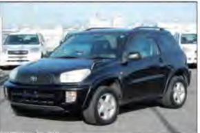
Ref.30129 PRICE: $5,430 TOYOTA RAV4 Year 2001 F 1,990cc PETROL Mileage 129,000km Color Black