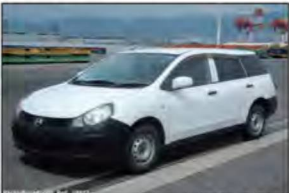
Ref.30322 PRICE: $3,220 NISSAN AD VAN Year 2012 AT 1,590cc PETROL Mileage 144,000km Color White