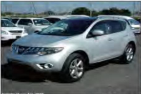
Ref.29088 PRICE: $7,960 NISSAN MURANO Year 2008 AT 2,480cc PETROL Mileage 159,000km Color Silver