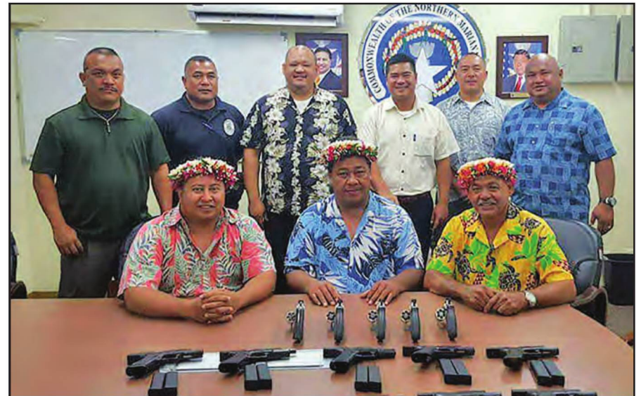
See "Kolonia Town" on page 5

San Nicolas has written to each of the police departments in Pohnpei's