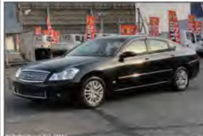
Ref.28437 PRICE: $4,040 NISSAN FUGA Year 2007 AT 2,490cc PETROL Mileage 180,000km Color Black