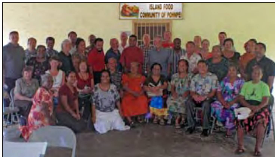
Island Food Community of Pohnpei (IFCP) members gathered together for its 2nd Annual General Meeting on June 24th, 2011