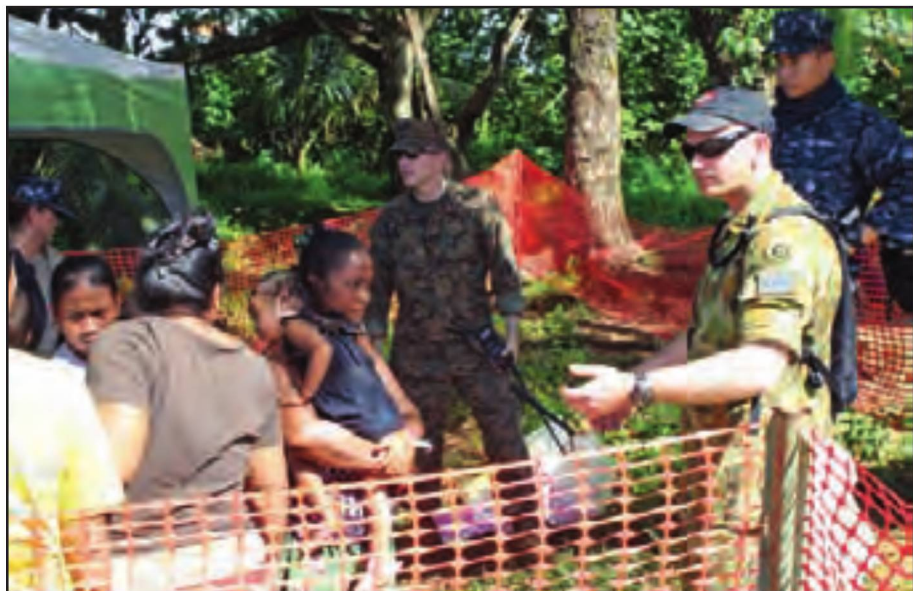
Triage at Nanpei Memorial School