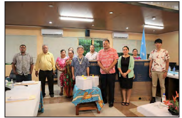
Those Concerned for the Project

strengthen six legislatures in the Pacific, namely: Fiji, Republic of the Marshall Islands, Samoa, Solomon Islands, Vanuatu and the FSM.