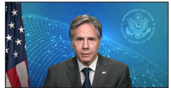
U.S. Secretary of State Antony Blinken provides his remarks to the Leaders of the 11th PICL

because that population rejects science doesn’t mean they can divorce themselves from feeling emotion. If led to anger, they will feel angry, and as we saw on January 6th, some of them will become violent as a means to feel power over the truths they have denied themselves to acknowledge.”