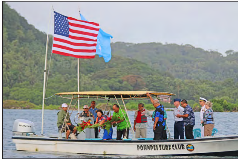
Embassy of the United States of America Kolonia