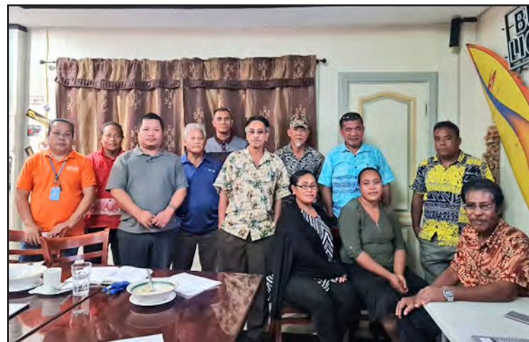
Magistrate Chiefs from all 11 Municipalities of Pohnpei State during UNICEF Support sensitization to improve COVID-19 vaccination uptake in Pohnpei State.

The Municipal chief all pledged to organize community engagement sessions with their people to share with them the new knowledge and updated information received about COVID-19 vaccination while motivating them to go for the COVID-19 vaccines when it is available to them.