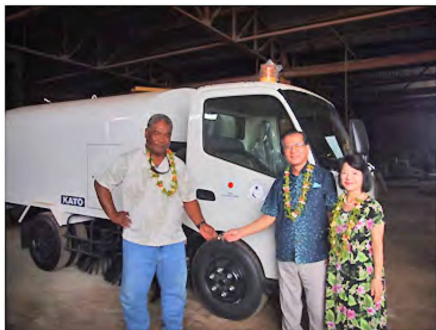
Handover of a key

The ceremony was witnessed by the staff of Chuuk State Government, the Chuuk Transportation and Public Works and the Embassy of Japan.